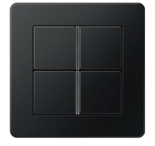
F 40 push-button 4-gang