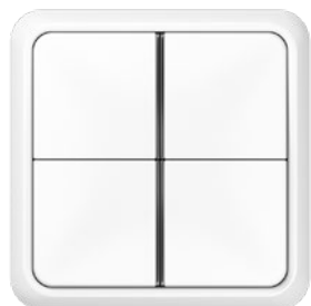
F 40 push-button 4-gang