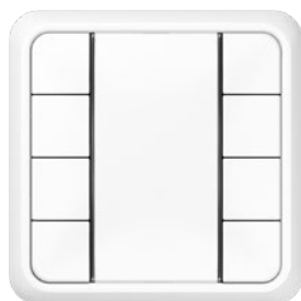
F 50 push-button 4-gang