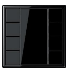
F 50 push-button 4-gang