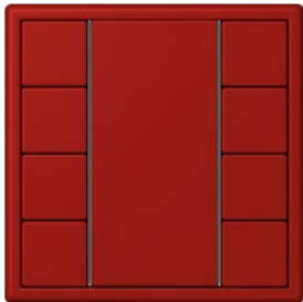
F 50 push-button 4-gang