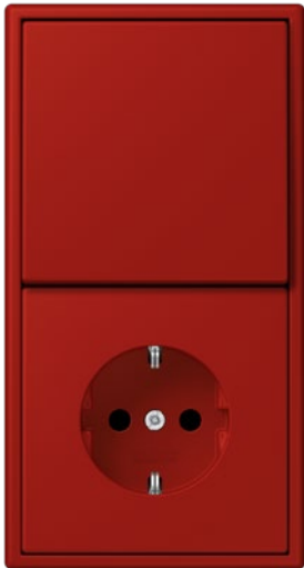
Switch/rotary dimmer combination