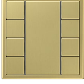
F 50 push-button 4-gang