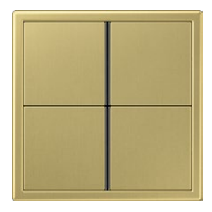
F 40 push-button 4-gang