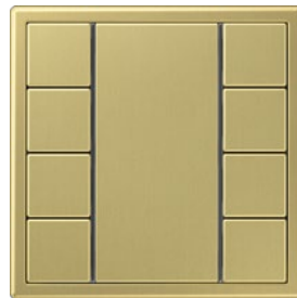
F 50 push-button 4-gang