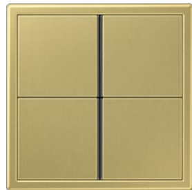
F 40 push-button 4-gang