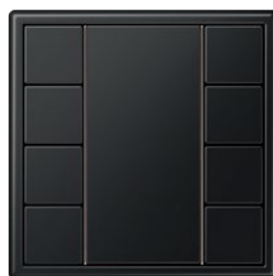
F 50 push-button 4-gang