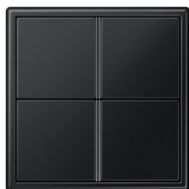
F 40 push-button 4-gang