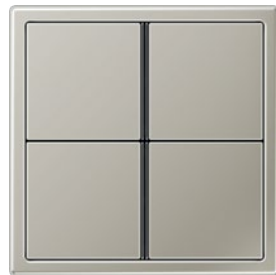
F 40 push-button 4-gang