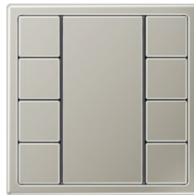
F 50 push-button 4-gang